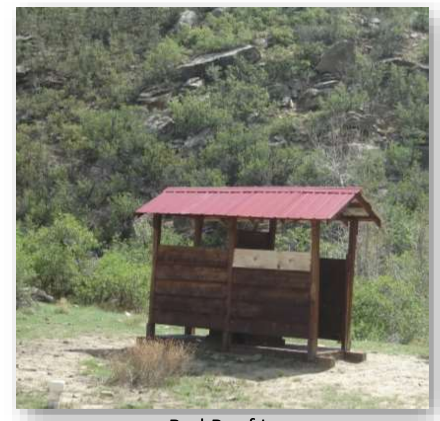
Red Roof Inn