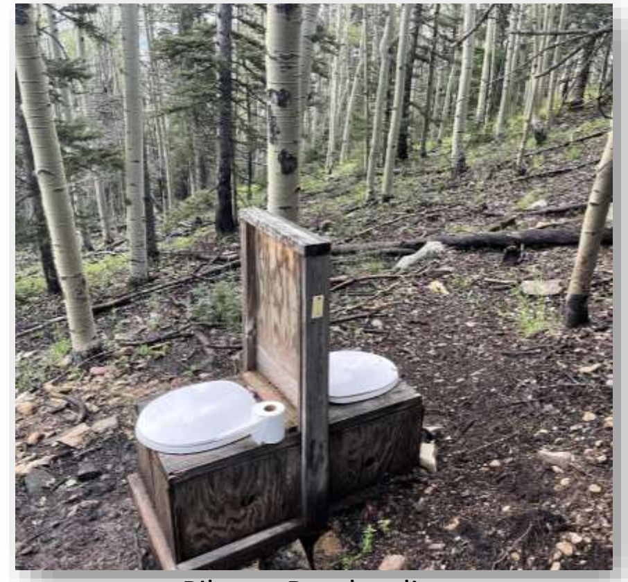
Pilot to Bombardier